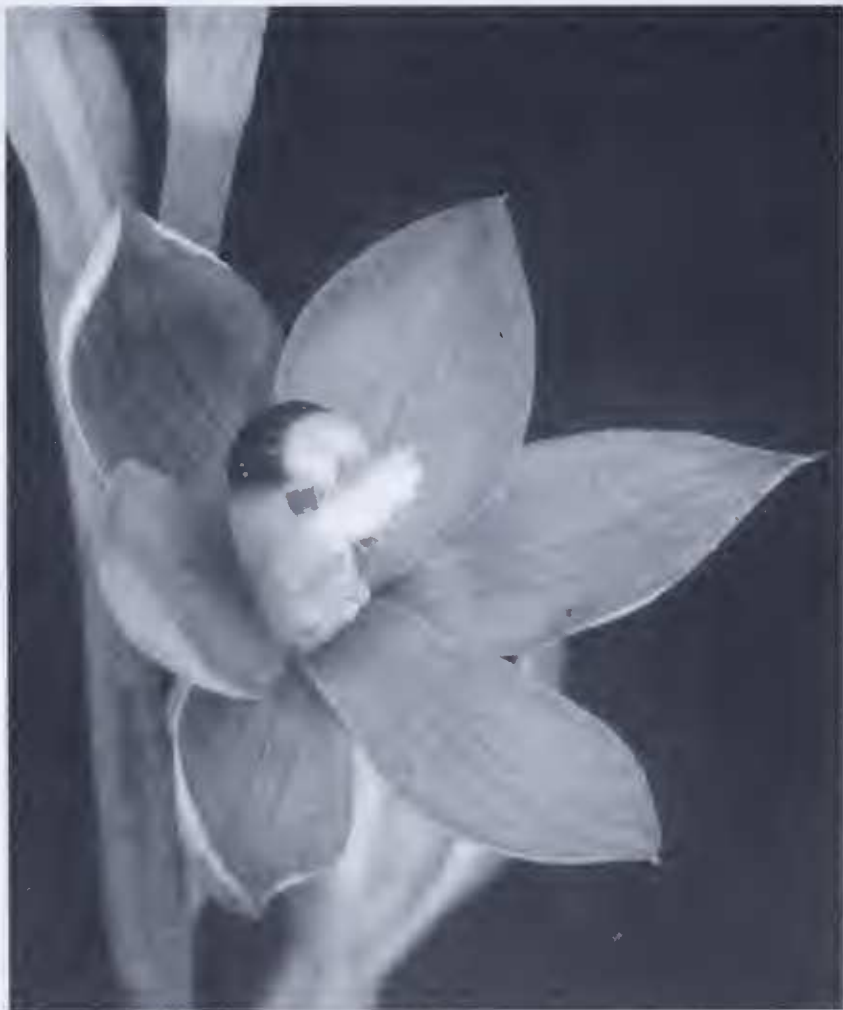
Figure 3. Thelymitra atronitida Mallacoota area